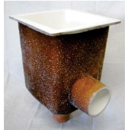
Frames and grates are sold separately